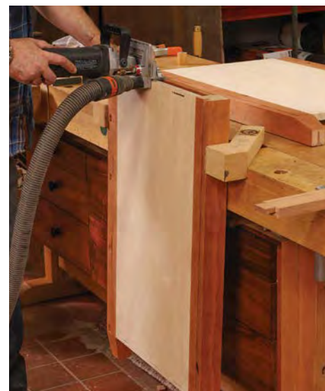
Slots in the side. To cut the biscuit slots in the plywood side panel, Hill clamped it with "bench puppies" like those described in "These Puppies Have Bite," FWW #253.