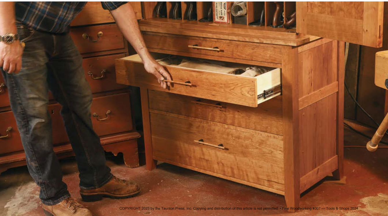
Heavy drawer opens with a soft touch. Hung on heavy-duty, full-extension slides, the drawers glide like a dream even when loaded with heavy tools.