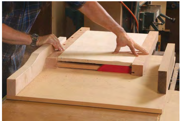
Trim at the top. Once the full side unit is dry-assembled, it gets trimmed across the top so the top rail, plywood panel, and legs are all flush.

I cut the rail tenons at the table saw. First I cut the shoulders with a crosscut blade, and then I cut the cheeks using a dado blade. With the workpiece held flat, I made several passes to cut one cheek, doing this on all the rails (and on a test piece). I then repeated the process for the opposite cheek of the tenons, starting out by using my test piece to adjust the blade height. I cut the tenons just a hair oversize, then skimmed the cheeks with a shoulder plane to get the fit that I like. Next, using