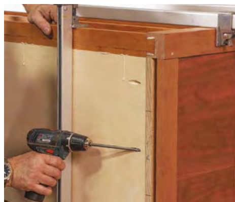
Pulling the top tight. Next, Hill uses a bar clamp to pull the top plywood panel forward, closing the biscuit joint with the top stretcher. Then he drives the pocket screws, pulling the top panel tight to the side plywood panel.