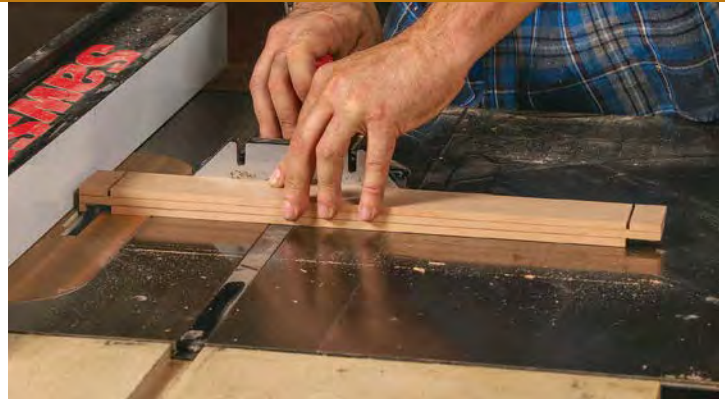
Rail tenons quickly cut. After establishing the tenon shoulders with a crosscut blade, Hill uses a dado blade and a miter gauge to cut the cheeks. He first cuts one cheek of each tenon, making several passes and using the rip fence as a stop. When one cheek is cut on all the rails, he flips them, adjusts the blade height, and cuts the second cheeks.