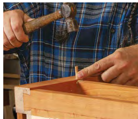
Pretty pins. Drawbore pins bring the drawer dividers tight to the leg and add traditional punctuation to the joint.