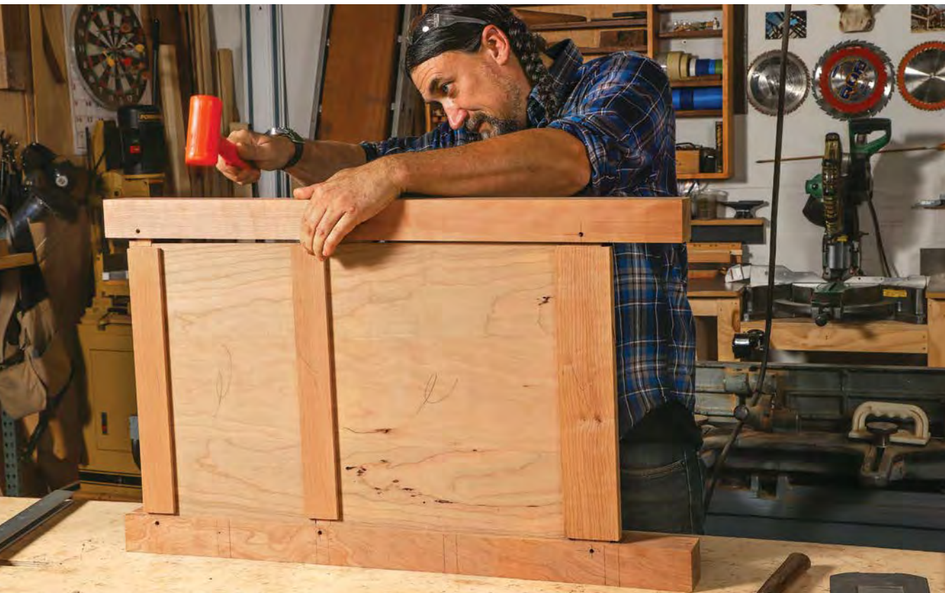
Dry-fitting the side unit. With the legs, rails, and panels fitted, Hill dry-assembles the solid-wood parts of the side unit.