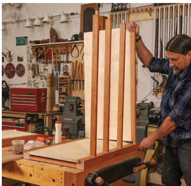
Starting upright. Final glue-up begins with the side unit flat on the bench. Drawer dividers are inserted vertically, including the bottom one, which is already glued to the bottom plywood panel.