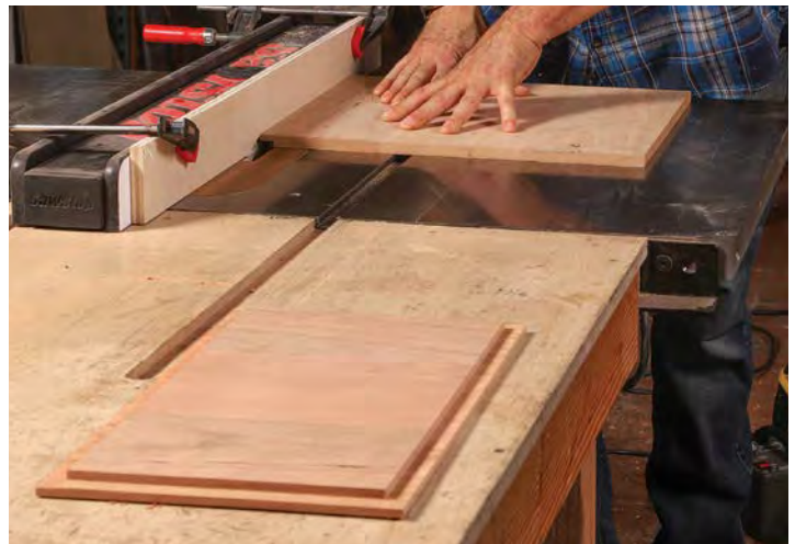
Panels get tongues. A rabbet cut around the perimeter of the side panels produces a tongue sized to fit the grooves in the legs and rails.