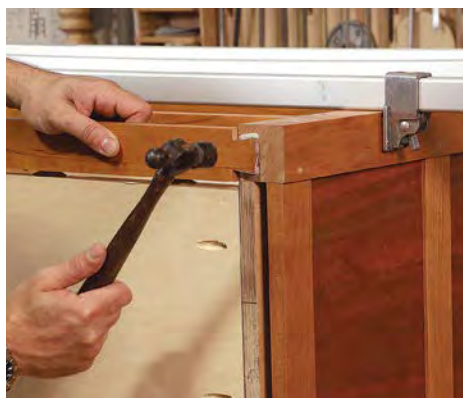
Adjustable biscuits. After the top plywood panel is in place, Hill slides it back enough so the biscuits across its front edge won't interfere with installing the top stretcher. Then he knocks the stretcher dovetails home.