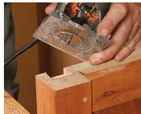
The last link. In order to transfer the top stretcher's dovetail onto the top of the leg, Hill first dry-fits the drawer dividers and the cabinet's back. After tracing the dovetail, he begins the sockets with a trim router, cutting close to his layout lines, and follows up with chisels.