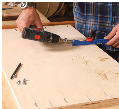
In the pocket. For the top plywood panel, as well as the bottom one, Hill drilled for pocket screws, which reinforce the biscuit joints and function like clamps at glue-up to pull the joints closed.

Next I fully disassembled the side units, tapered the bottom section of the legs, and prepared for glue-up by finish sanding and pre-finishing. Then I glued up the two side assemblies—the legs, rails and panels, and the plywood side panel.