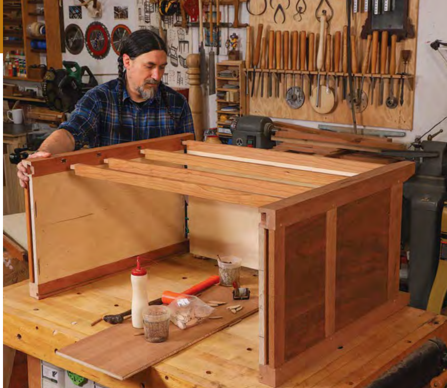
Tip the case and fit the tenons. The second side unit goes on with the case on its back, making it easier to align the biscuit joint and then insert the divider tenons little by little.