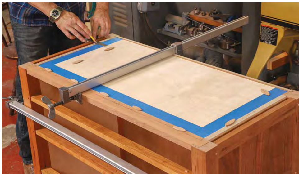
Biscuit layout. The top of the plywood inner case gets biscuited to the plywood case sides and to the top stretcher. It gets blue taped to be sure it doesn't wind up proud of the parts it is joined to.