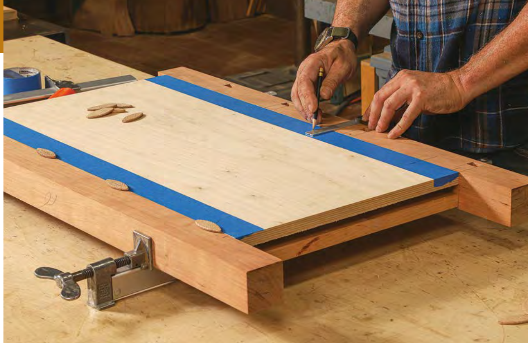
Marking for pins and biscuits. With holes for drawbore pins already drilled in the leg, a tap of the brad-point bit (above left) produces a center mark. After disassembly, Hill will offset the centerpoint mark toward the shoulder slightly so driving the pin will draw the joint tight. To mark for biscuits (above right), Hill clamps the side of the plywood inner case between the legs.