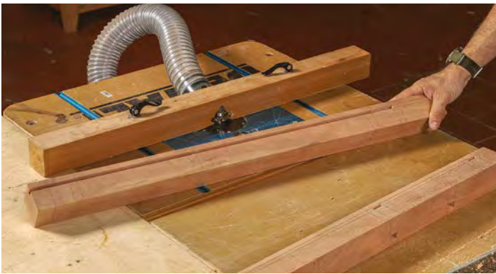
A groove connects the mortises. With a slotting cutter at the router table, Hill cuts a stopped groove in the leg for the solid-wood panels. The groove is aligned exactly with the rail mortises, it's just not as deep.