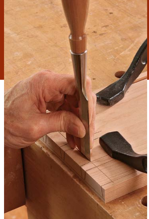
It's familiar at first. Start chiseling half-blind pins as you would through-pins. Place the chisel right in the scribe line (above) and begin with light mallet blows. Then pare out a shallow chip (below). The next mallet blows will be harder and the chips thicker.

visible. Then I saw on the waste side of the lines. If you don't mind "running saw-lines"—kerfs that extend past the baseline and are visible inside the drawer—you can define 75% to 80% of the socket with sawkerfs, making the chiseling decidedly easier. Many period cabinetmakers used this approach, including quite a few Shakers; I usually don't. Instead, I accept the more difficult chiseling in exchange for a clean look inside the drawer.