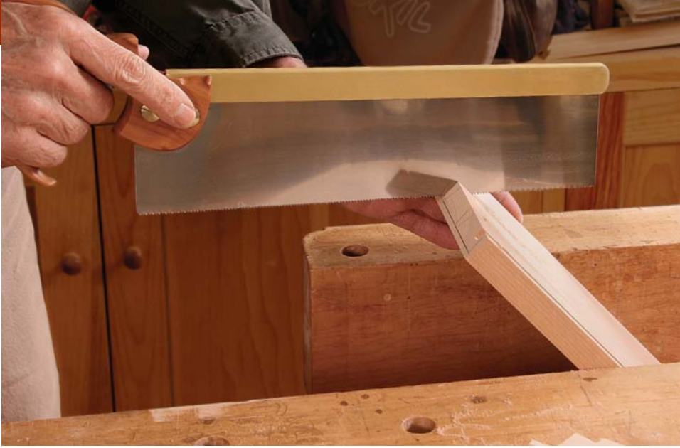
Careful kerfing. With the drawer front at 45° in the vise, saw along the cheeks of the pins until you reach the two scribed lines.