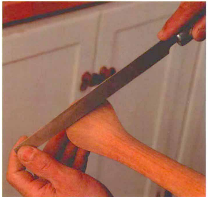
For best control, use two hands. Grasp the file or rasp handle with one hand, and hold the steel tip between thumb and forefinger of the other hand.

The way to hold a rasp or file is with one hand on the handle and the other on the tip of the rasp between thumb and forefinger (see the photo below). If holding the tip is uncomfortable for you,