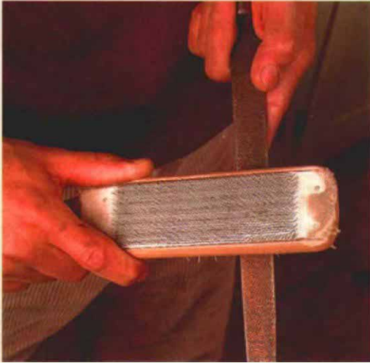
File card cleans rasps and files. Clean rasps and files cut more aggressively. File cards generally have a brush side and a wire side.

Rasps and files are heat-treated to make them about as hard as a woodworking chisel (Rockwell hardness rating of Rc60 to Rc68). This makes them effective cutting tools on wood, aluminum, brass and other nonferrous metals. And some files even can be used on soft (or annealed) steel. But because they've been hardened, files and rasps must be kept apart to prevent them from rubbing or banging together. Careless treatment might chip or dull the teeth and shorten file life. I store mine on a wall-mounted rack, like chisels. The blades are kept apart, and I can spot the one I need at a glance. I've also seen them stored in drawers, where slots or dividers keep the tools separated.