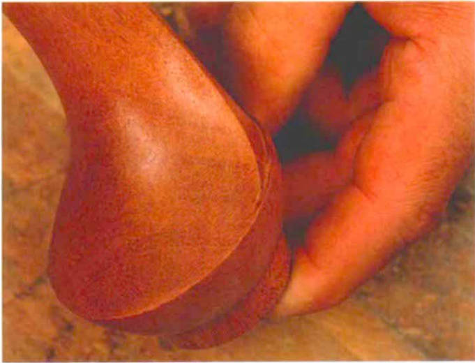
Filed, not sanded. The author put a coat of shellac on this cabriole leg after shaping it with a file, but without sanding it. Only minor tool marks are still visible.